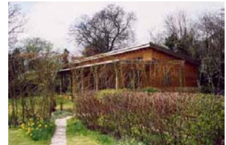
'The Project', Pevensey Levels, East Sussex