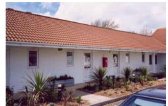
'The Place', Camber Sands, East Sussex