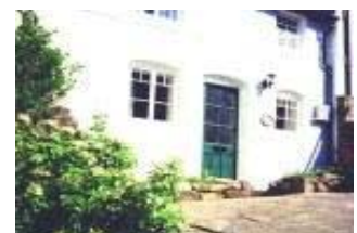
3 Shublands, Ashdown Forest, East Sussex