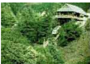
Water powered cliff railway Centre for Alternative Technology, Wales